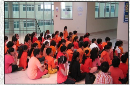
Who's feeling Orange?

On Tuesday 29th October, the school hosted its annual Healthy Eating Day. We, in Grade 4, dressed in orange and brought in healthy orange food to share with the children in our grade. Oranges, carrots, peppers and melons were among some of the fruit and vegetables that the children ate. We hope that Healthy Eating Day will start a Fruit Frenzy In the school. They are as important for the mind as for the body.