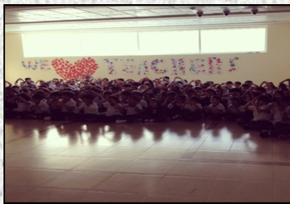
We Love Teachers!

October was an eventful month for ENS ! We grade 1s got to participate in three events! The first one was World Teachers Day on October 5 th . We contributed to the large sign by tracing and then cutting out our handprints. We all got to go to the Grade 4 Pod and take out pictures to remember this special day, where we appreciated our hardworking teachers.