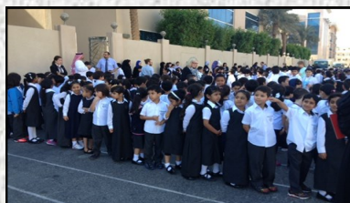
Grade 1 @ the Fire Drill

We also participated in a school wide fire drill, where we practiced getting out the school