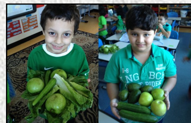
Green Foods for Grade 2!

able to taste avocado for the first time. It wasn't, however, fun and eating all the time because we also used our food to make up math's number stories. Our thanks go to all the parents for sending their children to school in green clothes and with such delicious and healthy food.