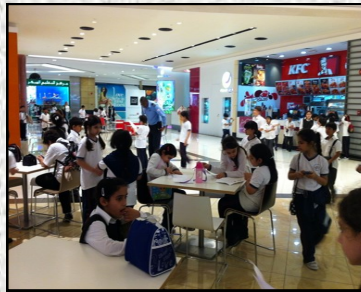
@ the Food Court

answers to clues in a treasure hunt and we had great fun looking for company logos and slogans. We really had to read some of the adverts carefully to find the answers! Once we had completed the treasure hunt, we ate lunch in the Food Court and then it was time to head back to school. We have learnt such a lot about advertising and in a fun way too!