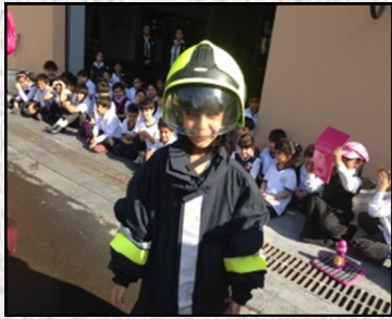
Grade 2 @ the Fire Station!

Following our successful trip to the Khalidiya Police Station, the children of Grade Two were taken to the local fire station. After an informational talk which included safety instructions from cartoon character Sparky, the canine firefighter, the children were given a demonstration of how to put out fires using fire