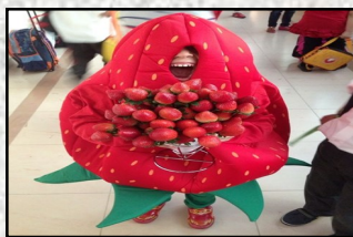
Dressed as a Strawberry!

Last but not least, us Grade 1s wore red and brought in loads of red fruits for healthy eating day! We had so much fun and some of us even came dressed as real fruits!