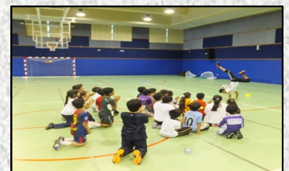
@ the FIFA U-17 workshop