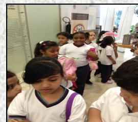
@ the Post Office

The final part of the Unit of Inquiry - Who We Are - found the children visiting the Emirates Post Office at Madinat Zayed. They weren't, however, just there to have a look around; they had actually gone as paying customers! As part of our literacy studies on How to Write a Recount, the children have been practicing writing postcards which could be sent to a teacher at ENS. Not only did the children have the chance of looking behind the scenes of a major sorting office but they actually got to see their