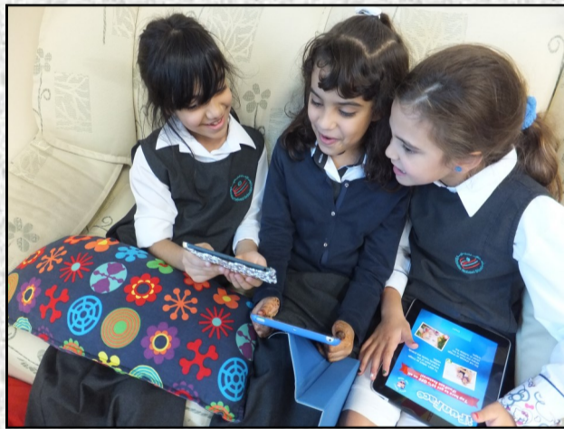
Gr 4 Students Creating on iPads

This month, the grade 4 students have been working hard to create a media presentation using animation software on their iPads