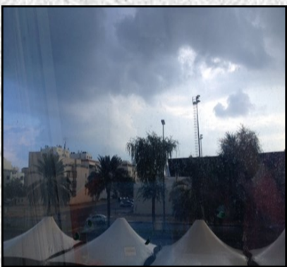
Dark Skies & Pouring Rain

Rainy weather and thunderstorms to National Day celebrations with Sheikh Mansour visiting are just some of the great things that the Grade 1s at ENS got to experience this past November. It has been a month full of excitement. We came to school and got soaking wet in the pouring rain which we all enjoyed so much!