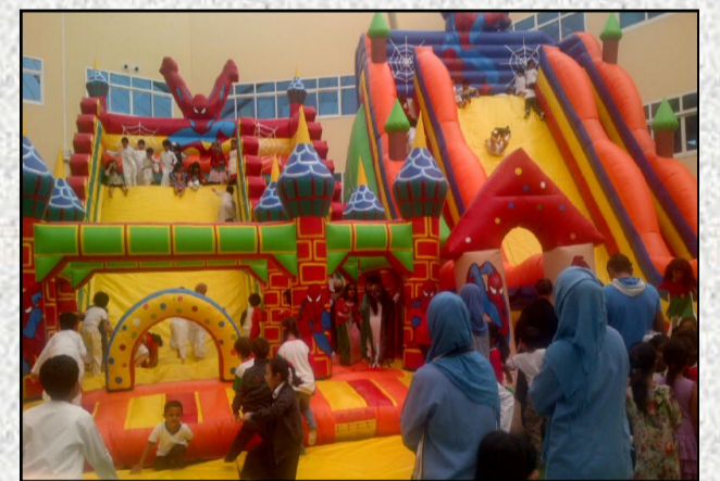
The children's' eyes lit up as they were greeted by the sight of three huge inflatable play areas.

didn't last as long as we had anticipated, we certainly packed a lot into a busy and enjoyable day!