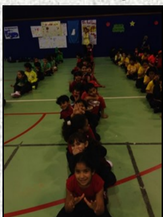
G1 Sports Day!

We went on a field trip to the Emirates Park zoo where we saw lots of different animals. We were risk-takers as we fed the different animals and touched some of them. We showed curiosity as we walked through the zoo and asked the teachers and the zoo guides many different questions.