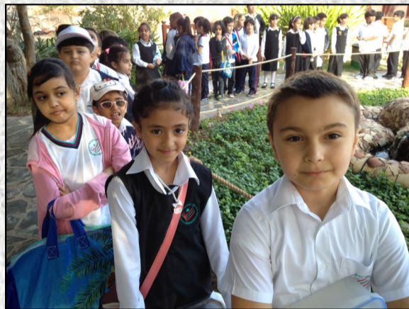
G2 @ Heritage Village

8 classes, each with a different name and color. We showed enthusiasm by singing and shouting and cheering the teams on as they were participating in the races! The grade 1s showed commitment to their teams and it was a fantastic fun filled sports day and a great start to the New Year!